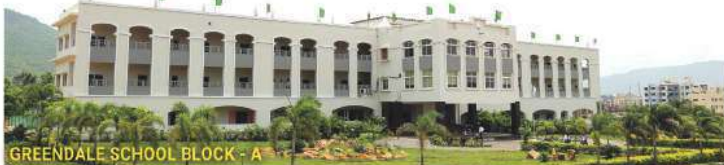
GREENDALE SCHOOL BLOCK - A