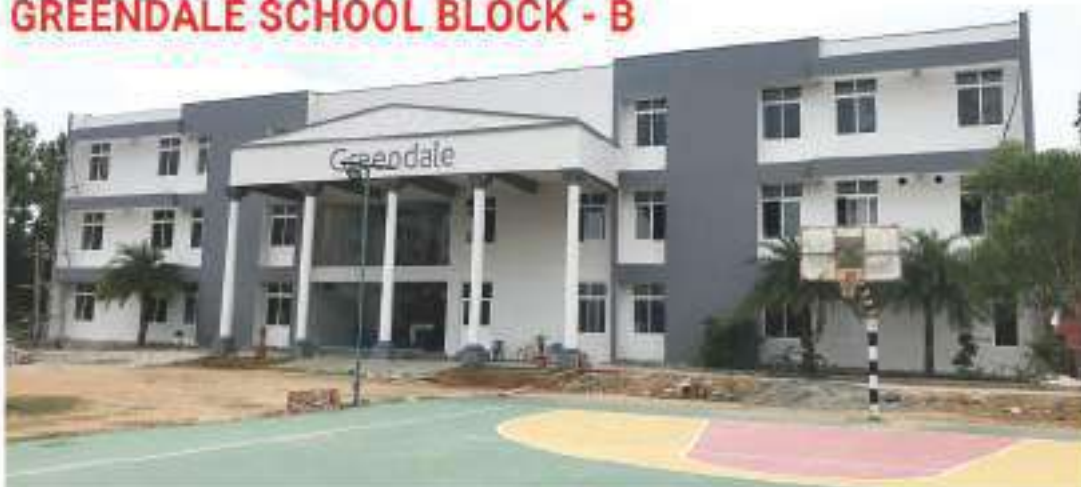
GREENDALE SCHOOL BLOCK - B

GREENDALE CITY OFFICE 1st Floor, Siripuram Towers, Opp. HSBC, Siripuram, Visakhapatnam - 03, Andhra Pradesh Call: +91 879 023 5500